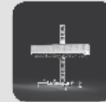
Hoist & Access