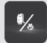
Air & Steam