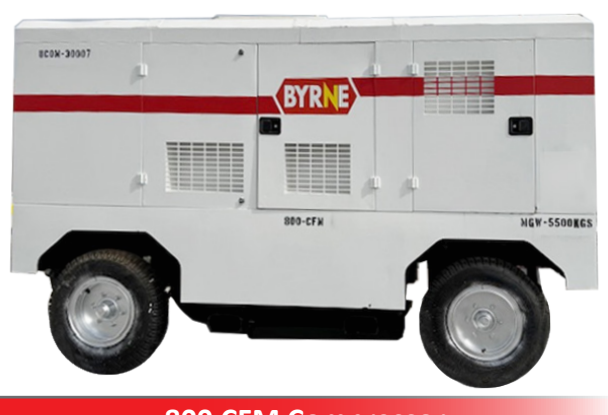
800 CFM Compressor